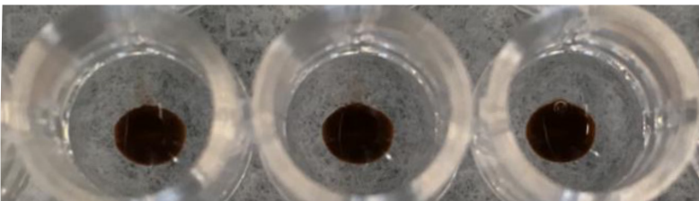
FIGURE 2 Following magnetic separation, the cell capture kit beads appear as brown pellets in the bottom of the plate wells.

The capture kit permits easier sample handling and visibility, which can help with tracking samples throughout the protocol. Without the beads, cells appear as semi-translucent pellets; following centrifugation, the beads are distinctly and intentionally brown (FIGURE 2).